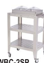
WBC-2SP 2 Pans & 2 Individual Lids